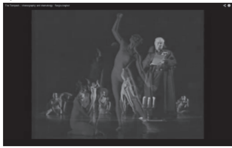
The Tempest - choreography and dramaturgy: Sergiu Anghel (Anghel's youtube channel >>http://www.youtube.com/watch?v=jkAa7bUk-Is)

posture of the head, neck, back (in ancient ritualistic dances, the displaying of weapons had an apotropaic function, protecting against forces which threatened the order of the world). The chaotic predicates are rendered through figures of decline: steps staggering sideways and backwards, heavy balance, shaking, walking/crawling on all fours, collapsing.