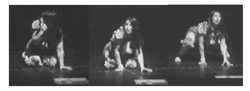
Ariel, the ethereal spirit: ascend ing movements Caliban, the beastly spirit. Low movements

fours, like a wild defeated animal: with his hands and both of his knees on the ground, and his head lowered. The good spirits place one knee only on the ground, keeping their backs straight and heads upwards. How one supports oneself (on one or both legs) constitutes, in this scene, a distinct postural trait which serves for actantial individualization. Adjuvant – winner, in a posture which compensates (by the ascending posture of the back and head) the downward meaning of kneeling. Opponent – defeated, bending his entire body towards the ground. Kinesic figures verbalized through the same term ("to kneel") correspond, on the semantic level, to different predicates (to conquer/ to be defeated) and different actants. The semantic (predicative) value of the two figures is established in the co(n)text.