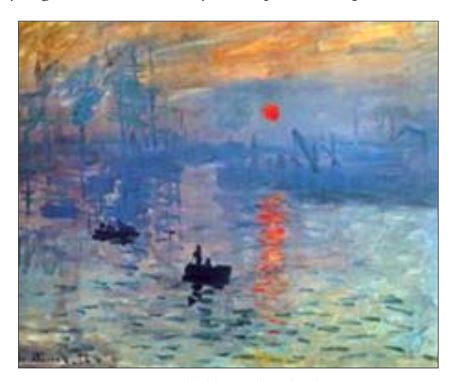
Fig. 1. 'Impression, soleil levant' by Claude Monet, 1872

The poem clearly inscribes itself into the impressionist tradition, given the French title and its paratextual connections evoking Monet's 'Impression, soleil levant' ("Impression, sunrise", 1872, 1. Figure). The painting represents a hazy Le Havre harbour with the vague shapes of boats in the background and the redness of the rising sun. The horizon seems to have disappeared; sky and water have become one, the hues of clouds, mist and sea are merged together in the foggy morning harbour. Among the impressionists, it was Whistler who embodied, for Wilde, the very essence of "cosmopolitan intellectual sophistication" (Sturgis 178). Wilde and Whistler were neighbours in Tite Street, Chelsea which was the geographical epicentre of the new "aesthetic craze" they represented (Cox 71). Situated on the edge of the expanding London city, between the age-old King's Road and the Thames, Tite street and the bohemian inhabitants of its independent studio-houses would soon challenge the values of the age and embody a new aesthetic art and architecture well into the twentieth century (Cox 28). Although Wilde complained that Tite street was a rather "horrid address", in the "Keats House", as he called it, "he was at the centre of an artistic milieu that both nurtured and defined his own identity as an aesthete" (Cox 88). The new intellectual and artistic epoch that originally began in Paris eventually developed in that quarter of Victorian London.