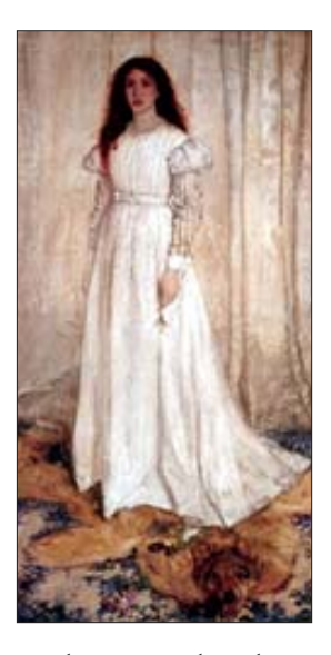
Fig. 5. "Symphony in White No.1: The White Girl" by Whistler (1862)

The theme of the femme fatale as the erotically menacing object of the fin-de-siècle male gaze in the London demi-monde is a prevalent topos in Victorian literature (Wagner and de Gruyter 280). With regard to the intermedial significance of the colour white, Whistler's 1862 painting titled "Symphony in White No.1: The White Girl" (1862, 5. Figure) is attested to have been "the most beautiful painting Wilde had ever seen" (Sturgis 229). This painting would establish the new aesthetic school, a "fleshly school" which represented in England the new breed of art first conceived in Paris (Cox 18). "The White Girl looked almost sickly with the pale, virginal Joanna Hiffernan standing upon a ruggedly masculine wolf-skin, with its fierce teeth projecting out of the frame" (Cox 16).