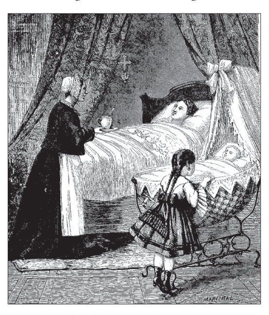
Fig. 3. André-Théodore Brochard (MD), "Le berceau," La jeune mère ou l'éducation du premier âge 1, no. 1 (November 1873), 8. Paris, Bibliothèque Nationale de France (print in the public domain; photograph provided by gallica.bnf.fr / Bibliothèque nationale de France).

The crib must, whatever its wealth or its poverty, entail an open-wire basket, never an impenetrable box. Mothers can therefore give free rein to their fantasy in this regard, choose walnut, mahogany, or rosewood, prefer silk nets or metal networks; the significant thing is that they make the baby a latticed nest and not a compact one. An airtight box is worth nothing for the infant.<sup>25</sup>