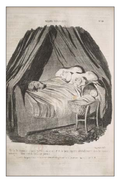
Fig. 4. Honoré Daumier, Behold the moment (after midnight) when calm and peace truly reign in happy homes. Better late than never (Crie donc, Voilà le moment (passé minuit), où le calme et la paix règnent véritablement dans les heureux ménages. Vaut mieux tard que jamais), from the series Married Life (Mœurs conjugales), pl. 29, published in Le charivari 9, no. 528 (22 November 1840) lithography, 23 x 25.2 cm. Paris, Bibliothèque Nationale de France, Cabinet des Estampes et de la photographie (artwork in the public domain).

babies' cradles, so long as they are elevated above the ground, in fact, compacted wooden cradles were utterly prohibited by all doctors, as they "can be impregnated with bad smells, be invaded by bedbugs, are too difficult to clean not to reject them absolutely." As bedbugs, fleas, and lice left noticeable marks on babies' pale skin, they were not only a sign of maternal negligence but also denoted bad hygiene, both physical and moral. 33