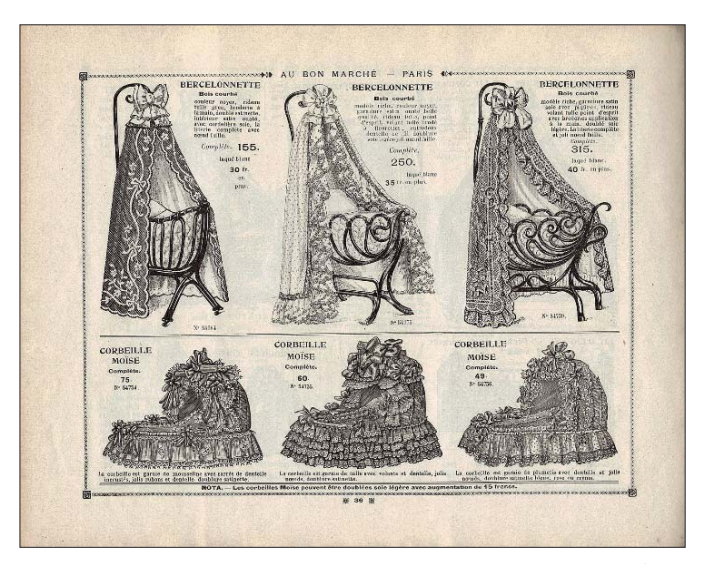
Fig. 7. Au bon marché, maison A. Boucicaut, album des layettes, catalogue (Paris, 1907), 36. Paris, Bibliothèque Nationale de France (print in the public domain; photograph provided by gallica.bnf.fr / Bibliothèque nationale de France).

sold in department stores, such as the Bon Marché . A rather simple wooden crib, "walnut color, Greek tulle curtains, hand embroidery, double sateen, padded with satin interior and silk strings, complete bedding with a knot," cost 155 francs (fig. 7, no. 54684, on the upper left), whereas other, more sophisticated cribs, were sold for 250 to 315 francs (fig. 7, on the right).