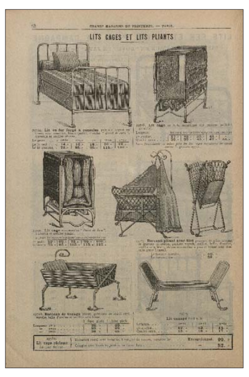
Fig. 8. Au Printemps, Paris, ameublements de campagne et de jardin, ménage, porcelaines, catalogue commercial (Paris, 1910), 52. Paris, Bibliothèque Nationale de France (print in the public domain; photograph provided by gallica.bnf.fr / Bibliothèque nationale de France).

necessity to avoid low-based devices due to the exposure to humidity, the risk of falls, or pet bites. Nonetheless, given such overall maternal enthusiasm, they submitted to the public's demands.