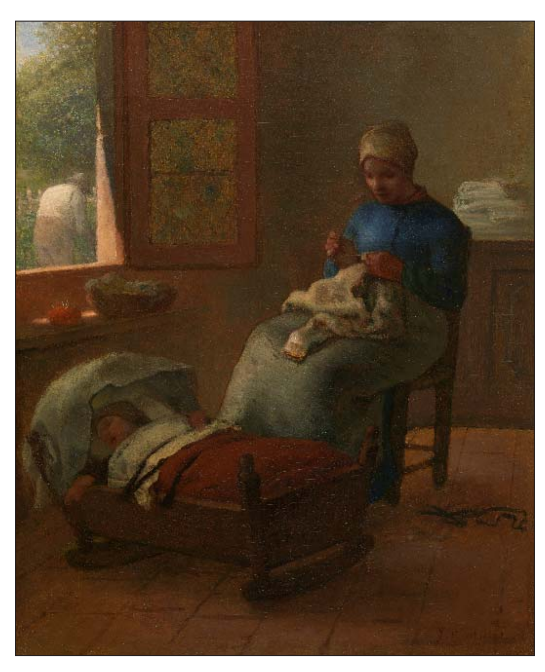
Fig. 2. Jean-François Millet, Baby's Slumber ( Le sommeil de l'enfant ), ca. 1855, oil on canvas, 46.4 x 37.5 cm. Norfolk, VA, Chrysler Museum of Art, gift of Walter P. Chrysler, Jr. 71.517 (artwork in the public domain).

Based on visual and material data, nineteenth-century infants' beds may be divided into four main categories: portable bassinets (basket-like containers), rockable cradles, immobile cribs, and toddler beds. The first category of footless, small-scale bassinets is appropriate for newborns before they can roll over, which generally happens between three to four months (see, for example, fig. 1, no. 59). Cradles, on the other hand, which are typically designed to produce movement through the addition of skate-feet or suspended baskets, are meant to be used by infants until they are capable of pushing themselves up on their hands and knees, generally between the ages of five to six months (see, for example, fig. 2). Cribs – which gained extreme popularity during the second half of the nineteenth century – are intended for toddlers until they can climb out, between eighteen to twenty-four months (fig. 1, no. 58). According to commercial catalogues, their length, ranging from 110 to 120 centimeters, was adjusted for toddlers, whereas their height, ranging from 190 to 210 centimeters, enabled the caregivers to attend to their child's needs efficiently. Finally, children's beds ( lit d'enfant ) were manufactured for older children until they reached adulthood (fig. 1, no. 55). While these objects varied in height (78 to 90 centimeters), their width (61 centimeters) and length (130 to 140 centimeters) guaranteed accessibility and comfort for both children and their parents.