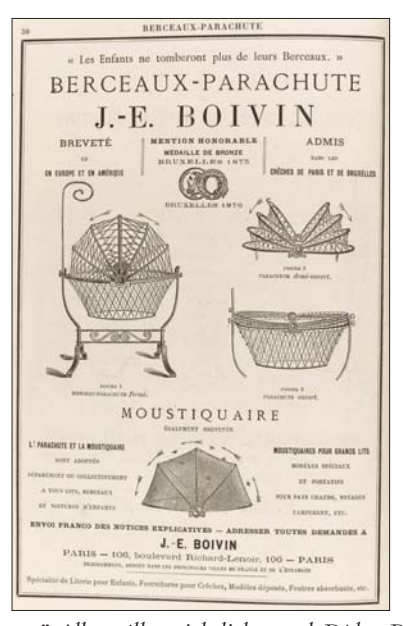
Fig. 10. "Berceaux-parachute," Album illustré de l'almanach Didot-Bottin, annuaire de la fabrique et de l'industrie (Paris: J. E. Bovin, 1877), n.p. Paris, Bibliothèque Nationale de France (artwork in the public domain; photograph published under fair use).

Whether or not this baby hammock was mainly designated for the convenience of the secondary user, other sleeping devices were chiefly manufactured to address potential accidents and health issues experienced by the primary user. In a column published by Brochard regarding potential cradle-based accidents, he warned parents about falls, which may occur when the child starts to roll over, proposing to cover the cradle with a mesh net. 80 Indeed, in 1870, the Parisian engineer Jules Emile Boivin issued a patent for an ingenious "parachute-cradle" (berceau-parachute, fig. 10).81