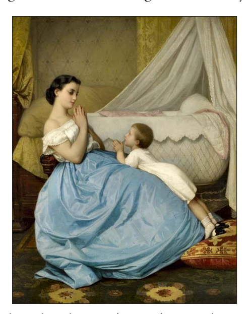
Fig. 5. Auguste Toulmouche, The Prayer ( La prière ), 1858, oil on canvas, 73.7 x 59.1 cm. Private collection. (artwork in the public domain; photograph published under fair use).

The association between metal cribs and social standing is clearly demonstrated by the baby's immobile, elevated metal crib portrayed by August Toulmouche in 1858 (fig. 5), which is so different from the wooden cradles occupied by babies from the lower classes (fig. 2). Comprising a mesh basket, padded with a mattress and a large lace pillow, it combines beauty, elegance, stability, and extreme cleanliness. While complying with medical recommendations, the pink trim on the baby's blanket denotes her female gender, thus underscoring her individuality.