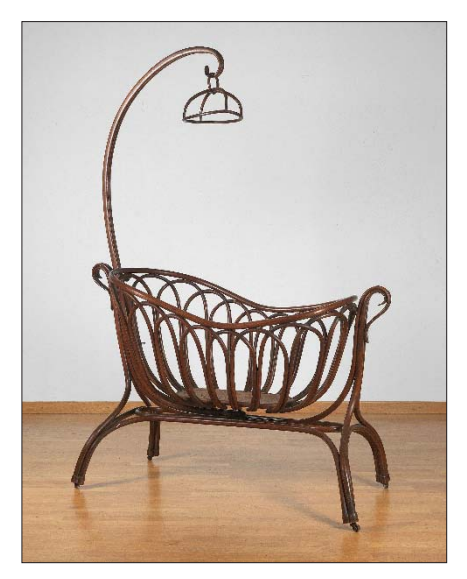
Fig. 6. Michael Thonet, Cradle, ca. 1895, bentwood, height: 208 cm, length: 150 cm, depth: 70 cm. Private collection (artwork in the public domain; photograph published under fair use).

Given that metal cribs became accessible to nearly everyone, the Grands Magasins offered expensive novelties for the affluent classes. As the appetite for luxury grew among the rapidly expanding bourgeoisie, most manufacturers substituted the previously accepted practice of custom-made furniture, favored by the nobility, with what could be called "shop method," which enabled them to exhibit their designs regularly in all the major department stores. The most notorious crib designer in fin-de-siècle France was the Viennese cabinetmaker, Michael Thonet. By mid-century, he had perfected a process by which solid wood rods could be steam-bent into complex curves, creating a cheaper, lighter, and more durable material than the traditional wood-carving techniques (fig. 6). Due to this process, he could make furniture from a small number of long, flowing, curved pieces of wood, while eliminating much of the prior necessary joinery. After installing special machinery for mass production in his factory in 1856, he exported numerous furniture items all over Europe and the United States. 61 Unlike early nineteenth-century elevated cradles, made of an oval bassinet suspended on wooden poles, specially designed to be rocked, 62 Thonet's cribs, sold in Paris at Boulevard Sebastopol, 92,62 were immobile. Elevated on decorated legs in the Art Nouveau style, with a prominent curved swan-neck pillar supporting the veil, such cribs blended style, utility, and hygiene.